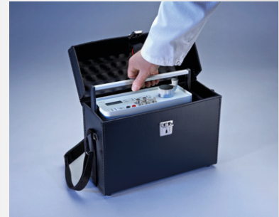
Carrying bag KAL 84 Order no. 9062.0001