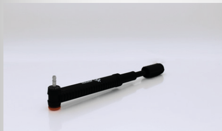
Hand pump KAL 84 Order no. 9601.0036