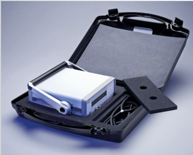
Transport case KAL 100/200 Order no. 9220.0002